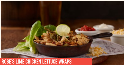
ROSE'S LIME CHICKEN LETTUCE WRAPS

Lime, garlic & cilantro marinated chicken breast strips grilled with chopped bell peppers & onions served with artisan romaine lettuce wraps, shredded cheddar, sour cream & fresh salsa - 13.99