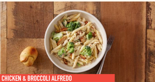
CHICKEN & BROCCOLI ALFREDO

Seasoned, grilled chicken breast & broccoli florets in a creamy alfredo sauce with parmesan & fresh parsley - 16.49