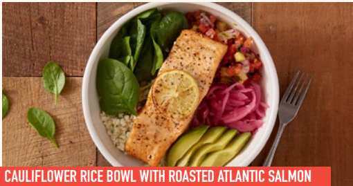
CAULIFLOWER RICE BOWL WITH ROASTED ATLANTIC SALMON

Fresh cauliflower rice seasoned lightly with lemon & cilantro topped with spinach, avocado, pickled red onions, island pico, light lemon vinaigrette - 17.99