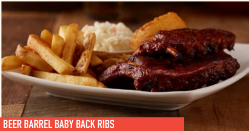
BEER BARREL BABY BACK RIBS

The best quality baby back pork ribs, slow cooked to perfection & glazed with your choice of sweet or spicy BBQ sauce Half rack 18.99 • Full Rack 25.99