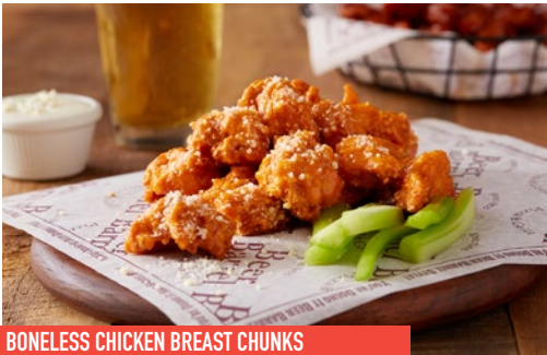
BONELESS CHICKEN BREAST CHUNKS

$1.99 up charge for all drums or all flats