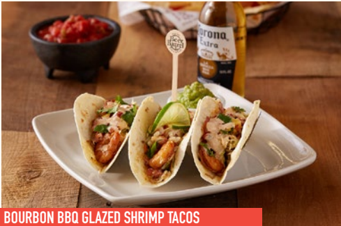
BOURBON BBQ GLAZED SHRIMP TACOS

Pepperoni, pork sausage, mushrooms, green peppers, onions, pizza sauce & provolone - 12.49