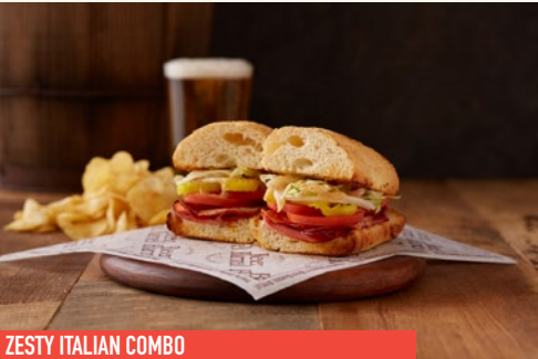
ZESTY ITALIAN COMBO