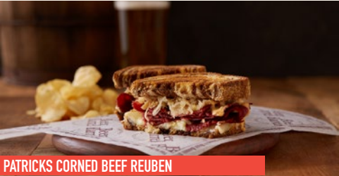
PATRICKS CORNED BEEF REUBEN

Fresh chicken breast, provolone, pesto sauce, romaine, sweet red peppers, & tomato - 13.49