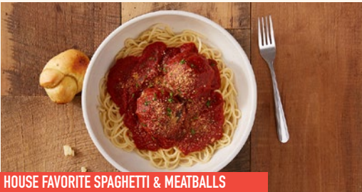
HOUSE FAVORITE SPAGHETTI & MEATBALLS

Delicious Beer Barrel house-made Italian meatballs simmered in our house-made marinara. - 13.99