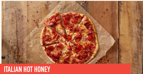
ITALIAN HOT HONEY

Spicy Italian Capicola ham, sweet peppadew peppers, whole milk mozzarella, crispy pepperoni on top, pepper-infused hot honey 12" 18.99 • 14" 22.89