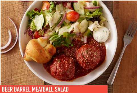
BEER BARREL MEATBALL SALAD

Two Beer Barrel house-made Italian meatballs, house salad tossed in BB House Vinaigrette with a dollop of ricotta cheese. Served with a warm garlic bread knot - 12.99