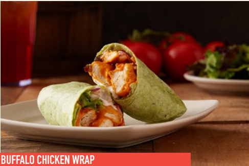
BUFFALO CHICKEN WRAP